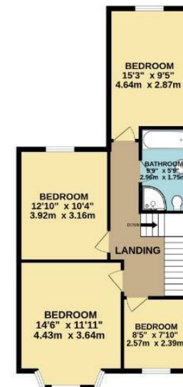
1ST FLOOR 671 sq.ft. (62.3 sq.m.) approx.